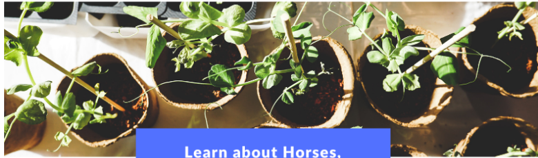
Learn about Horses, Livestock, and Horticulture

Meeting are at the Trigg County Extension Office For questions call (270)522-3269